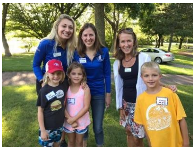
It was so great to meet up with friends at Summer Splash!